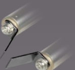
Ord.-Nr.: 21433 8 MM TIPS