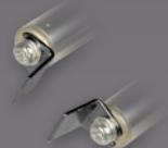
Ord.-Nr.: 21434 10 MM TIPS