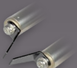
Ord.-Nr.: 21432 5 MM TIPS