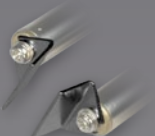
Ord.-Nr.: 21436 20 MM TIPS