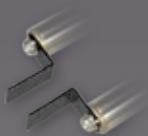
Ord.-Nr.: 21444 10 MM TIPS