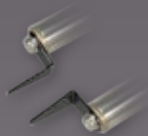
Ord.-Nr.: 21441 2 MM TIPS